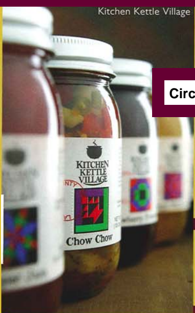
Kitchen Kettle Village