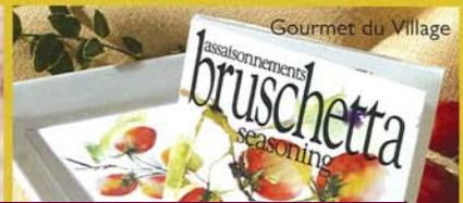
Gourmet du Village