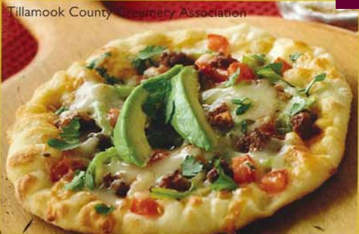
Tillamook County Creamery Association